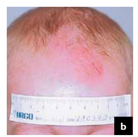
Fig 2.Young boy with forehead wound: day 0 (A) and at day 14 (B)